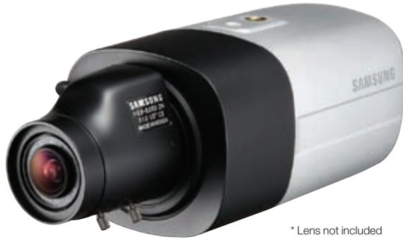
* Lens not included